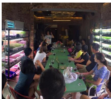
Debate in Singapore with Multi-disciplinary Experts of the Built Environment, Edible Garden City, Civil Society