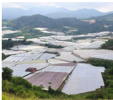
Environmental Justice Inquiry in Singapore and Malaysia (Cameron Highland)