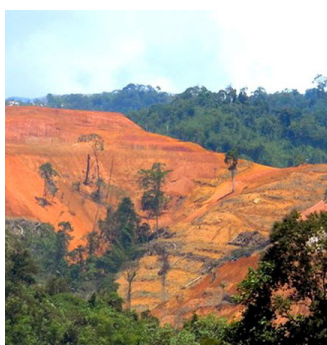
Environmental Injustice Inquiry in Cameron Highland, Malaysia. Meeting with Farmers, Experts and Civil Society